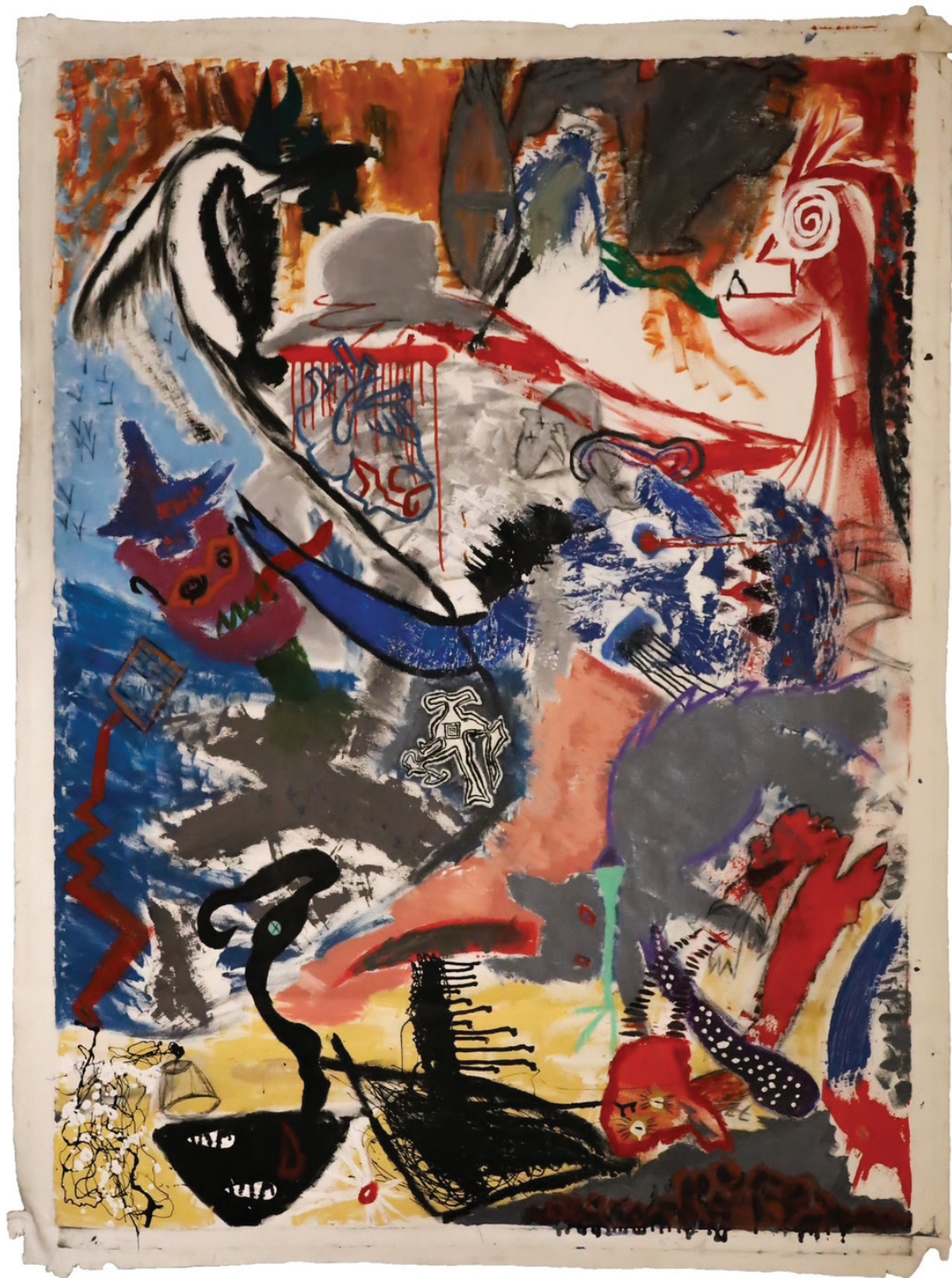
190×170cm / First / Mixed Media on Canvas