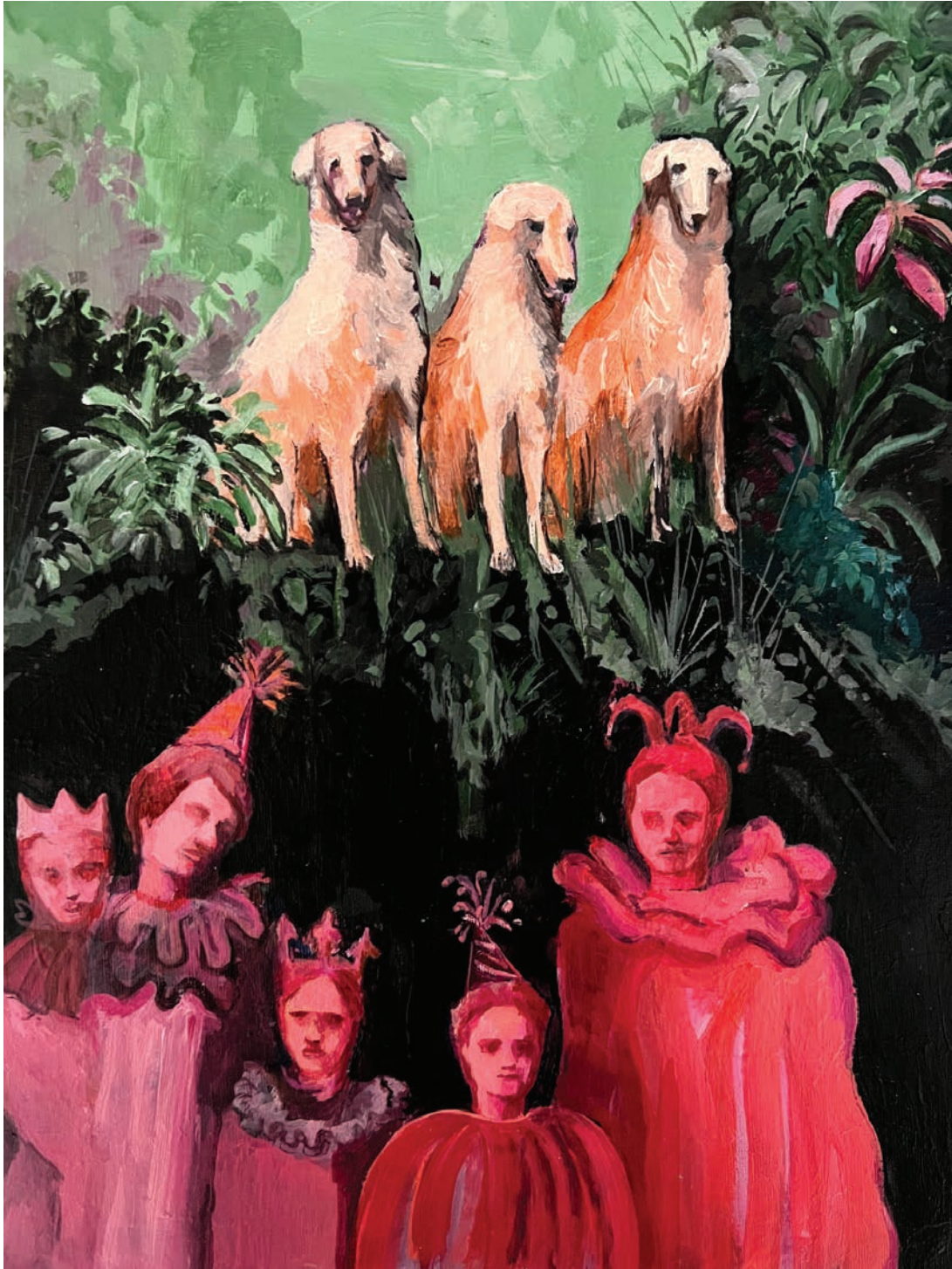
21×29.5cm / Royal family / Acrylic on canvas pad