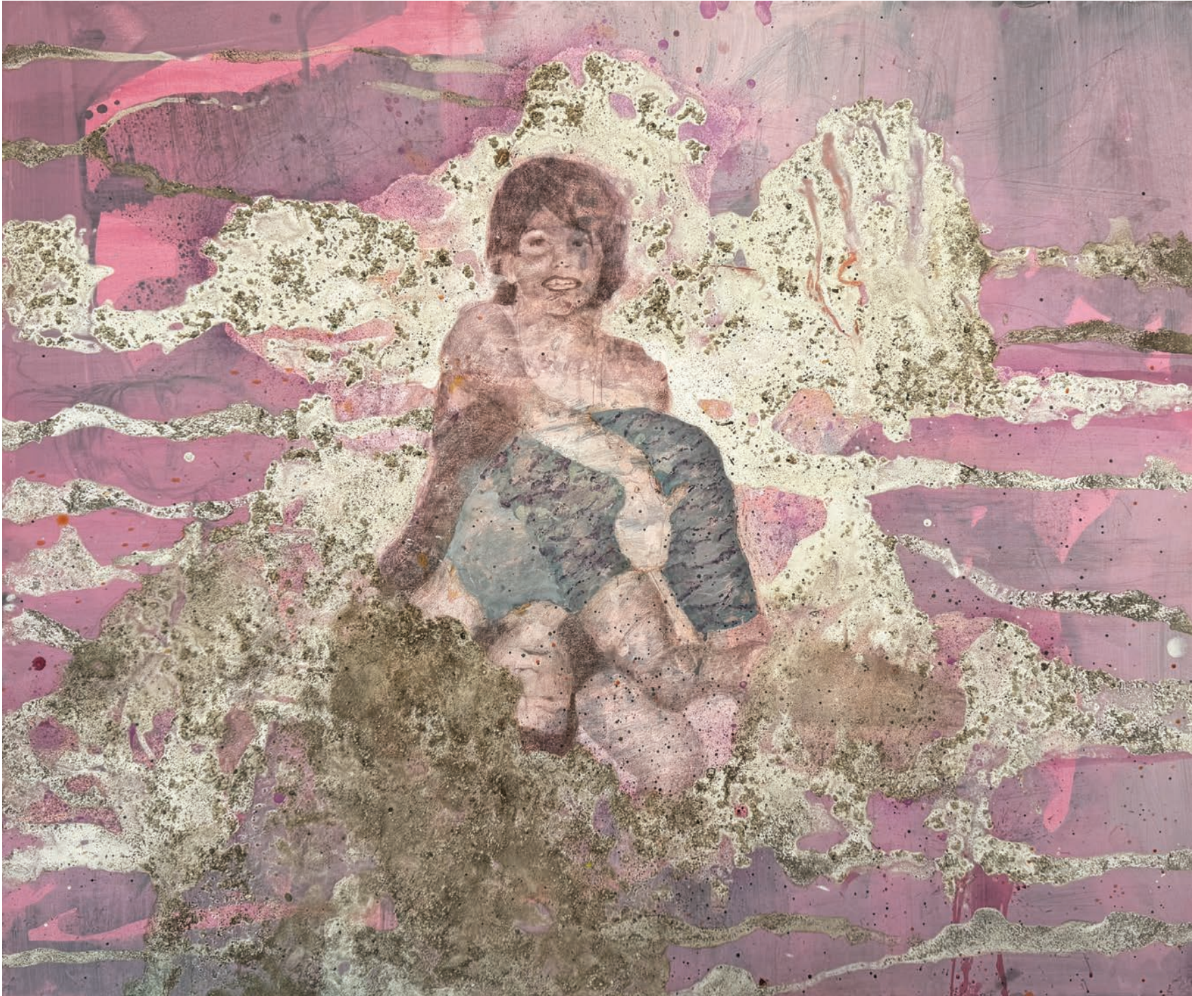
100×120cm / Pebbles / crylic and oil on canvas