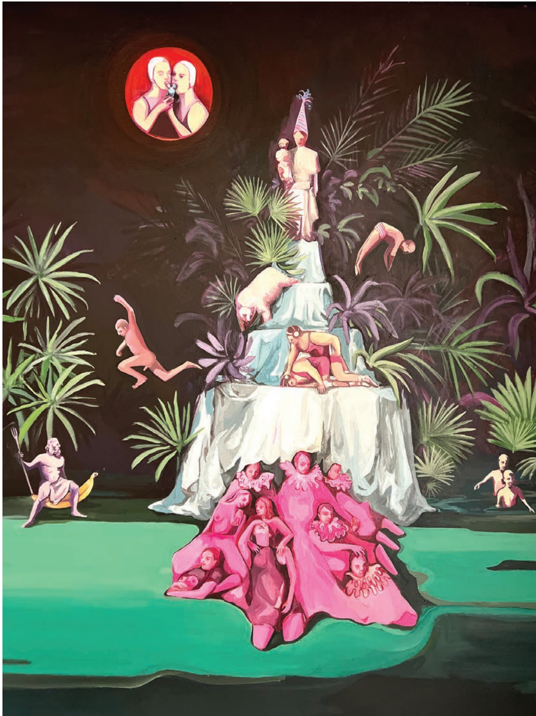
80×70cm / Blood moon / Acrylic on canvas