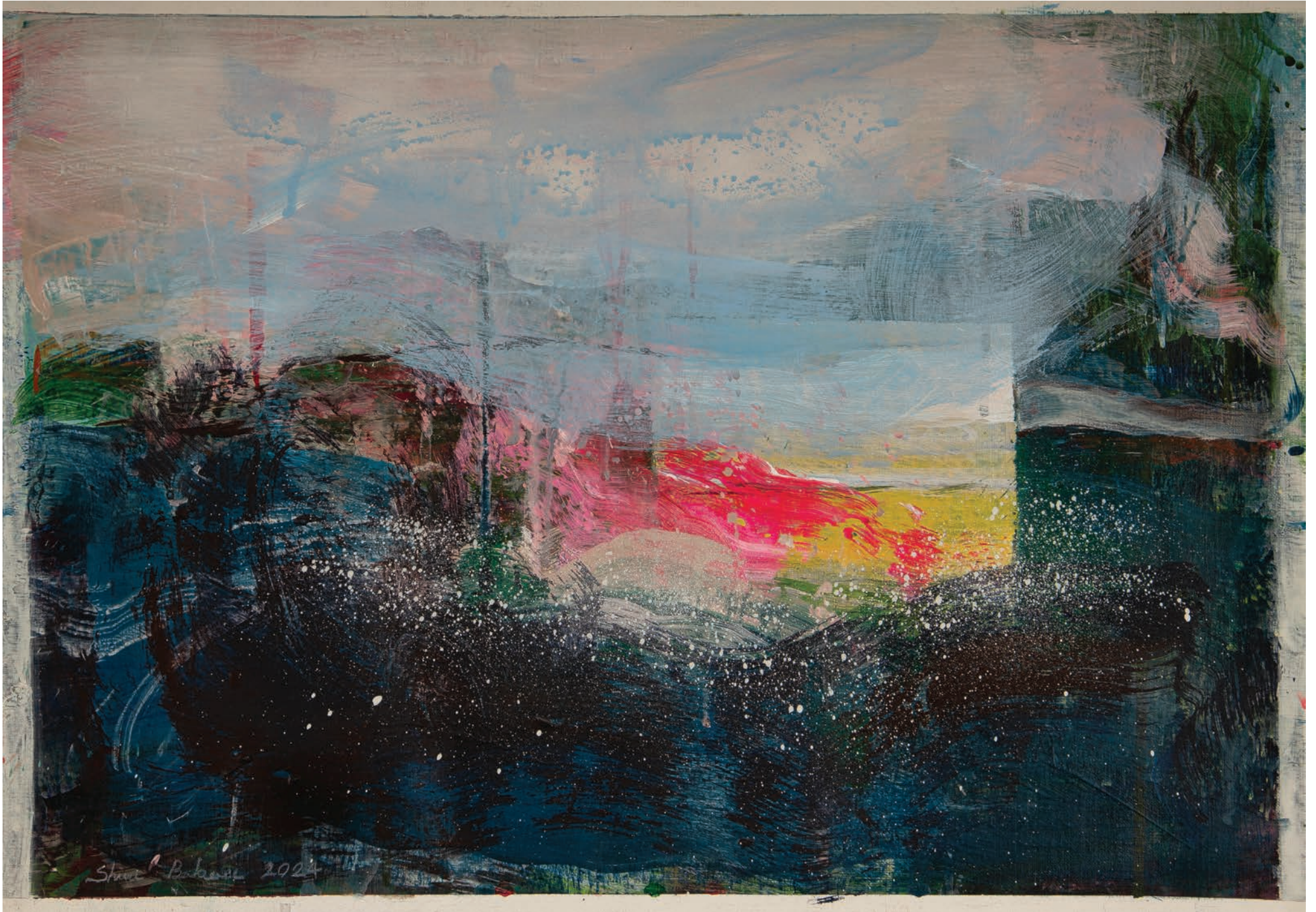
36×50cm / Acrylic on cardboard