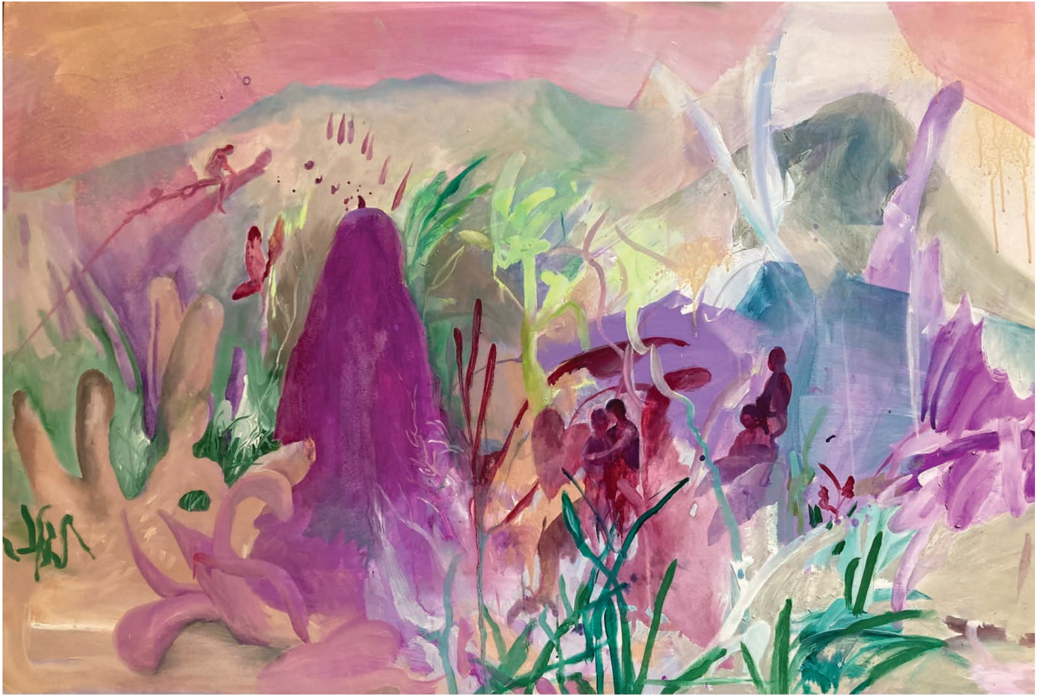
90×130cm / "heart -devouring love " series / acrylic & oil on canvas