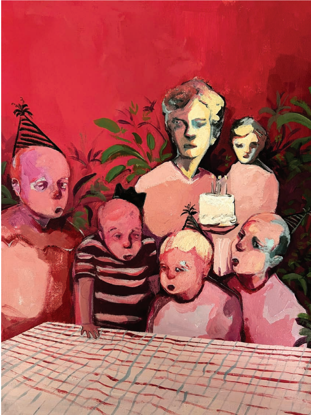
37.5×29cm / The coronation ceremony / Acrylic on canvas pad