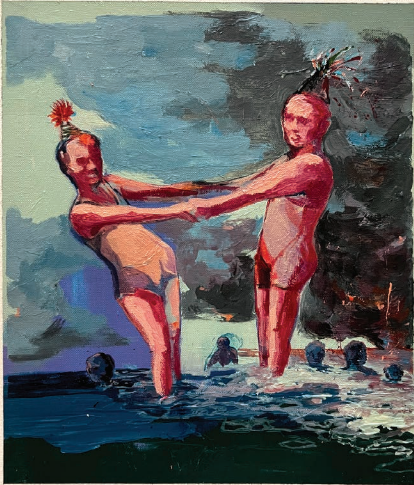
30×36cm / Golden hour / Acrylic on cardboard