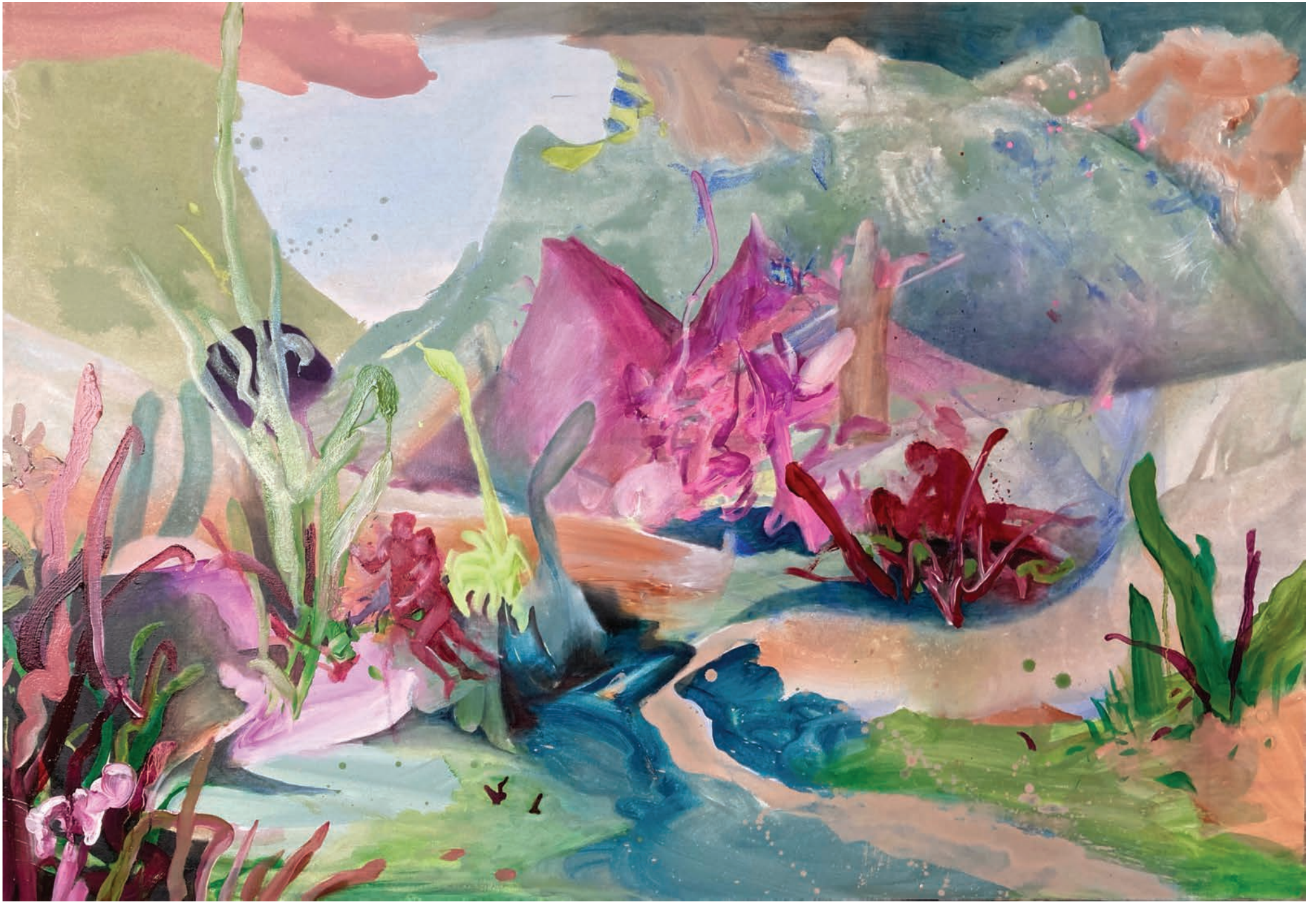
90×130cm / "heart -devouring love " series / acrylic & oil on canvas