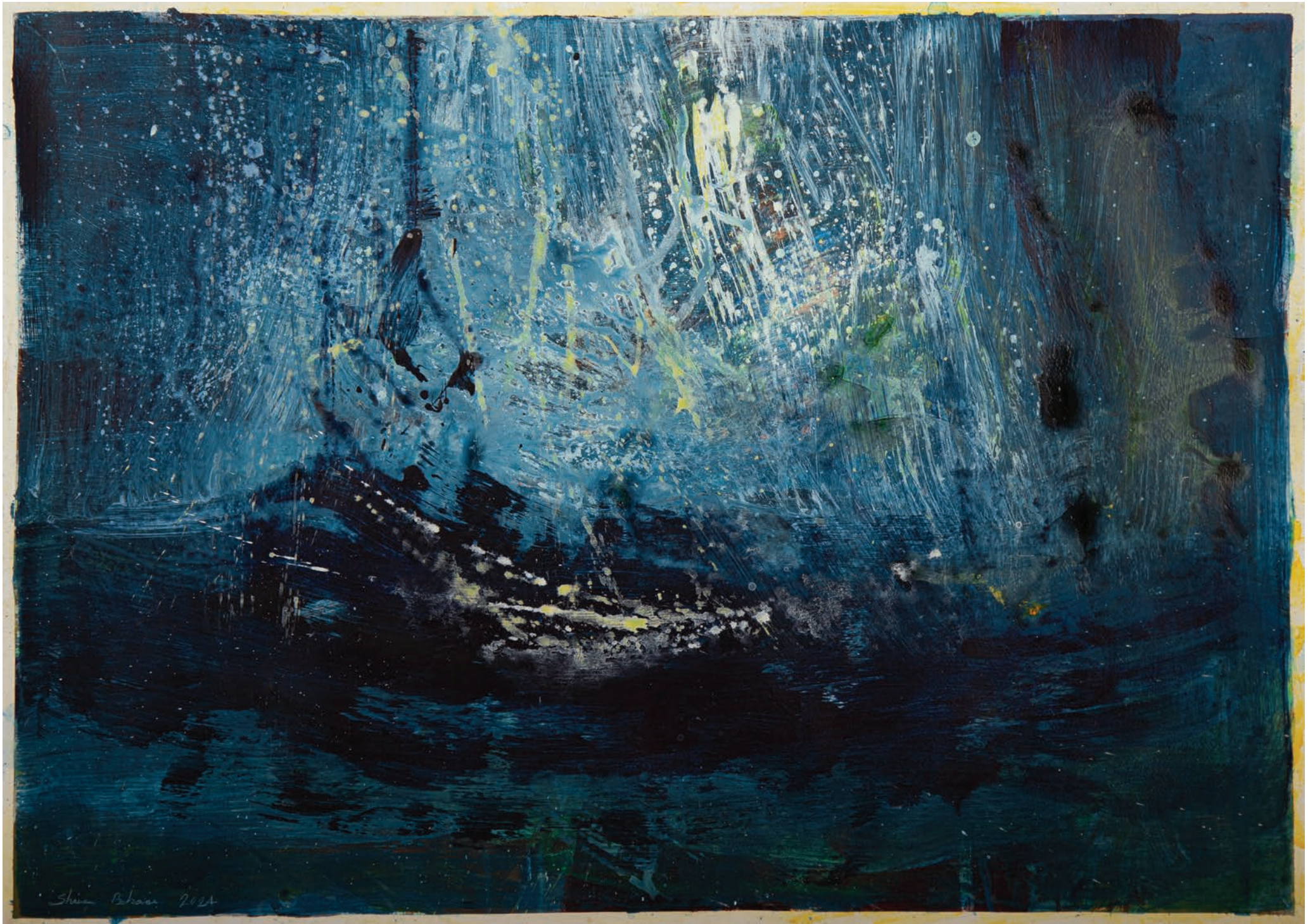
50×70cm / Acrylic on cardboard