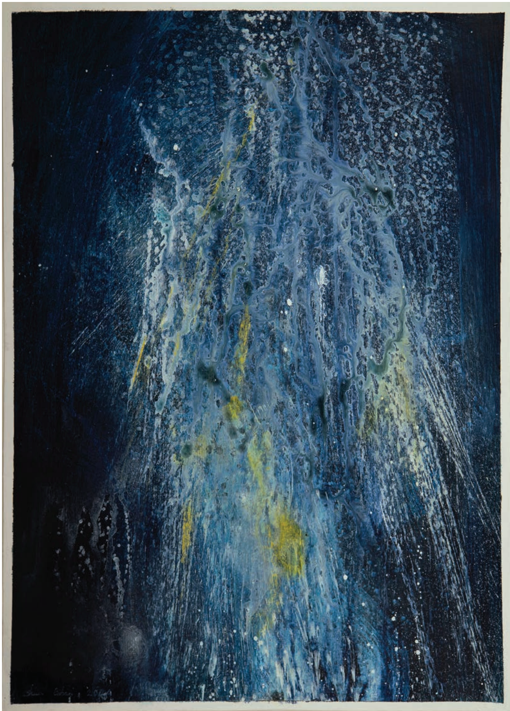
50×70cm / Acrylic on cardboard