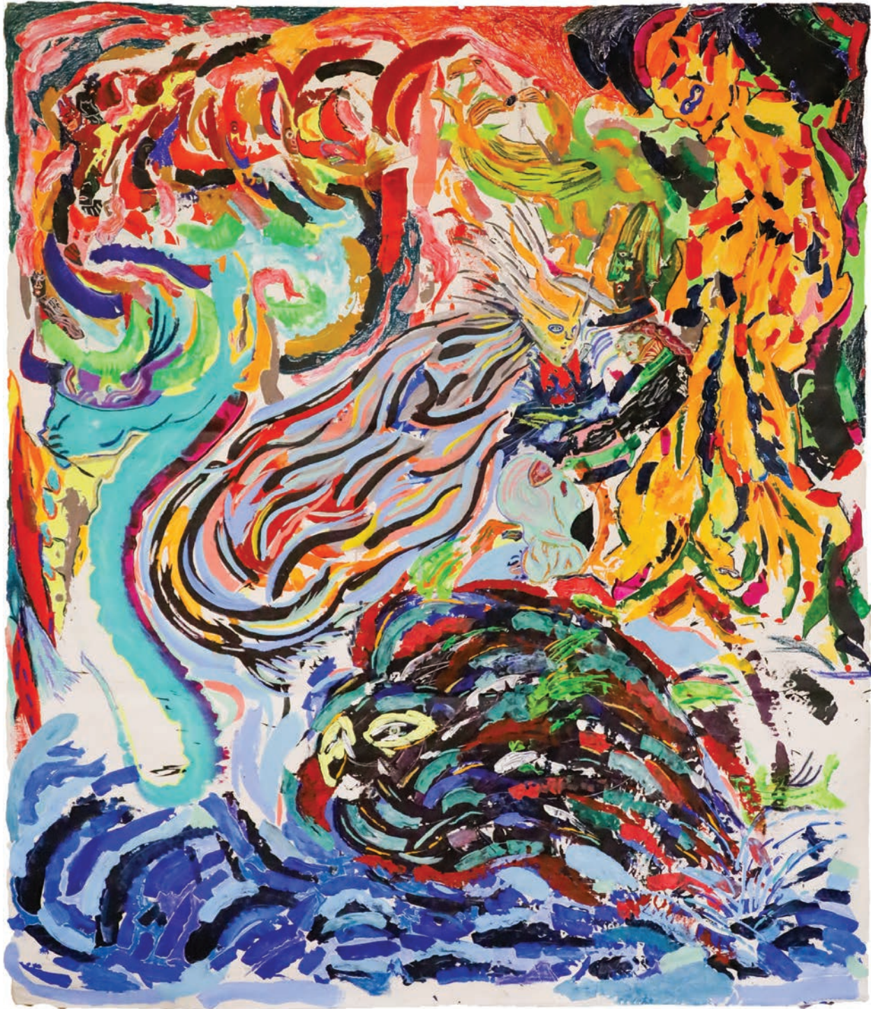
200×180cm / Evolution / Mixed Media on Canvas