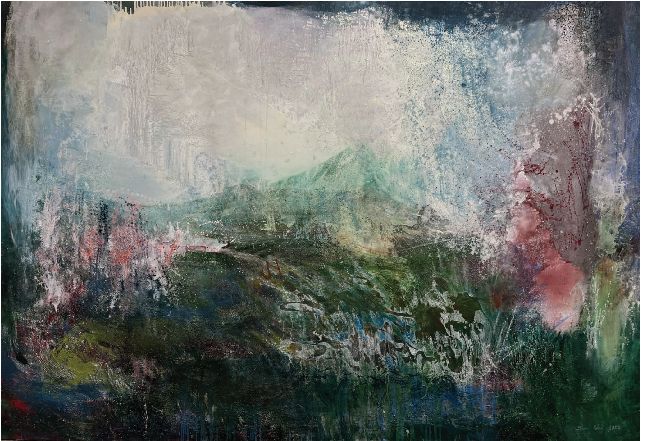
260×180cm, Oil on canvas