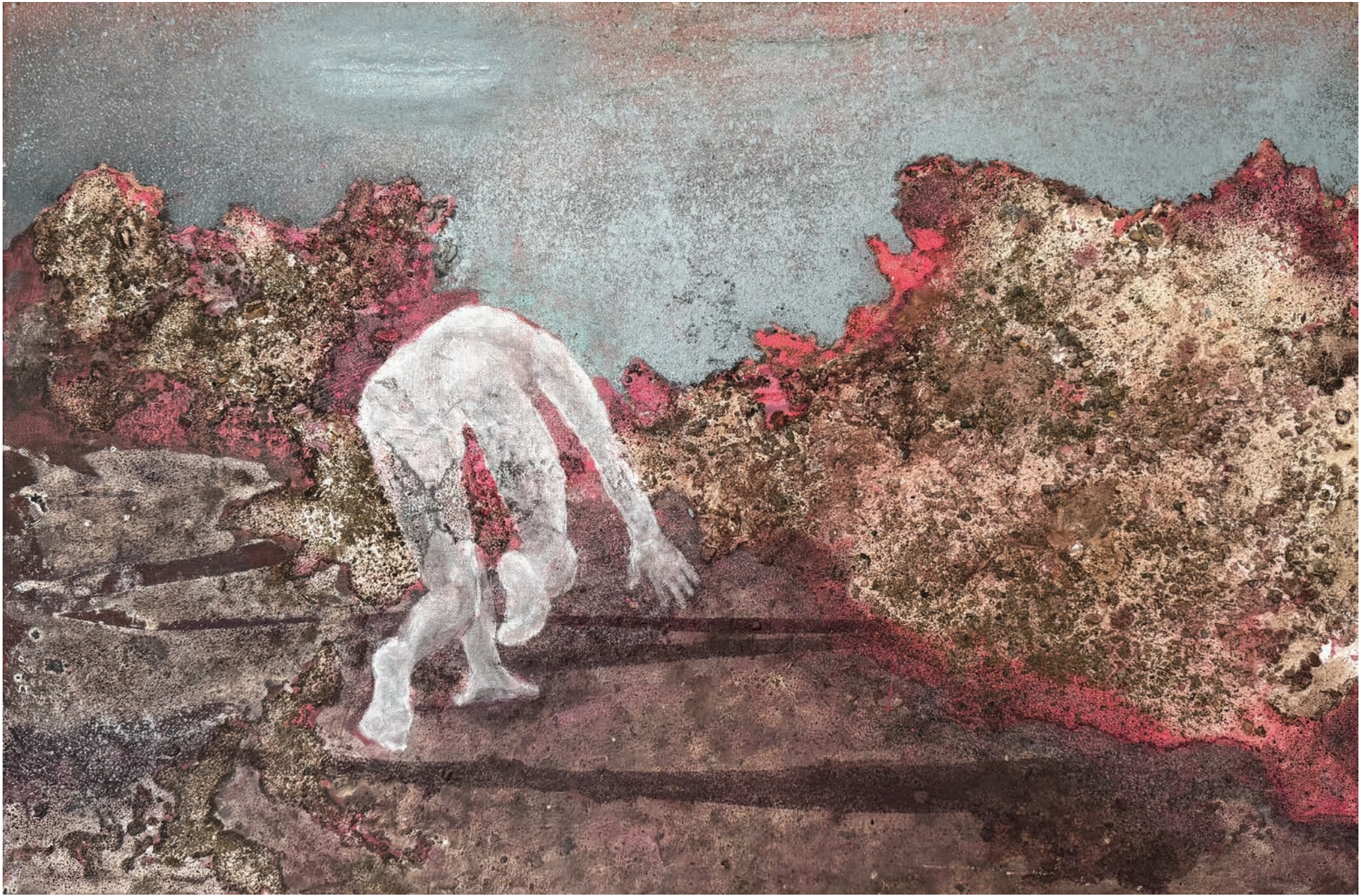
60×90cm / Pebbles / soil and oil on canvas