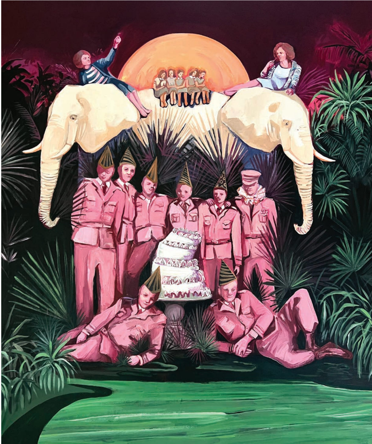
80×70cm / Perseverance / Acrylic on canvas