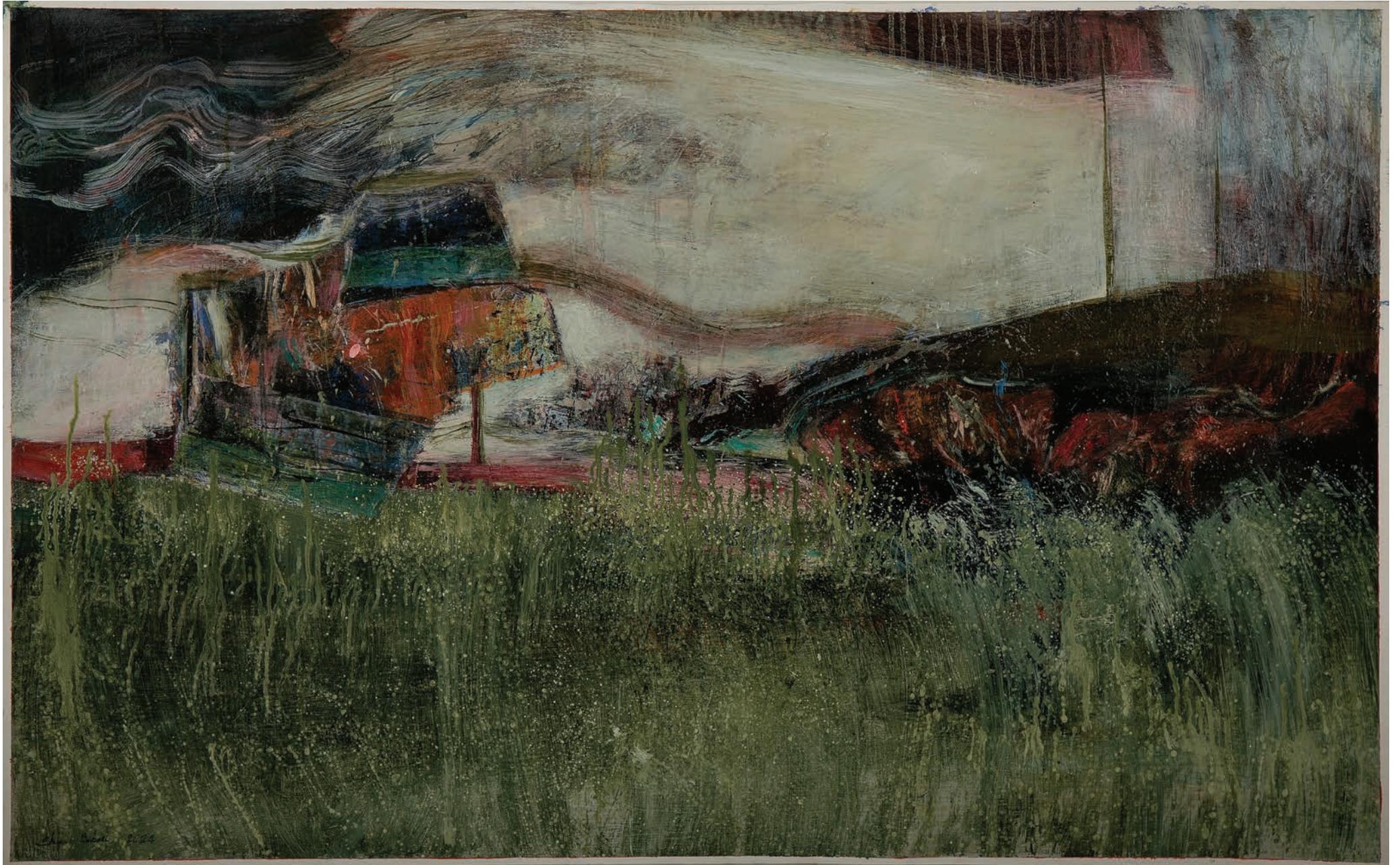
63×100cm / Mixed media on cardboard