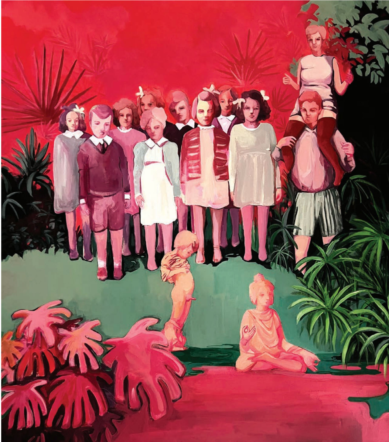
80×70cm / Peace! / Acrylic on canvas