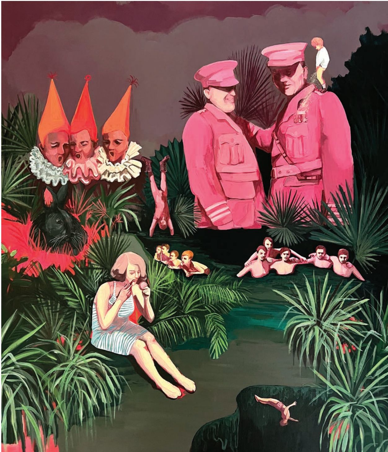
80×70cm / Struggle / Acrylic on canvas