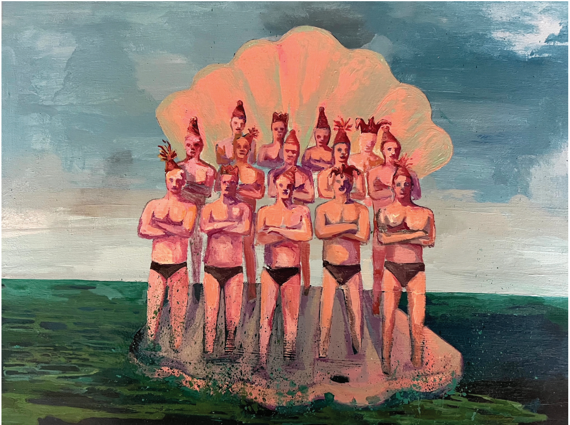
29.5×38.5cm / Everyone look at the camera please... / Acrylic on canvas pad